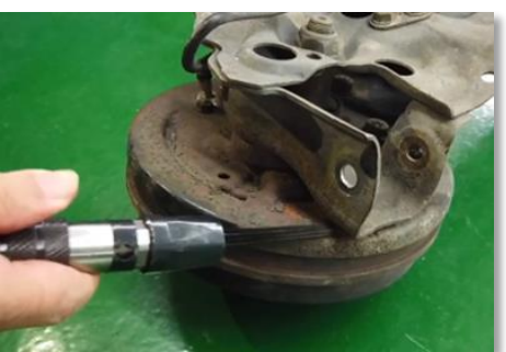
Wide up debris in narrow space